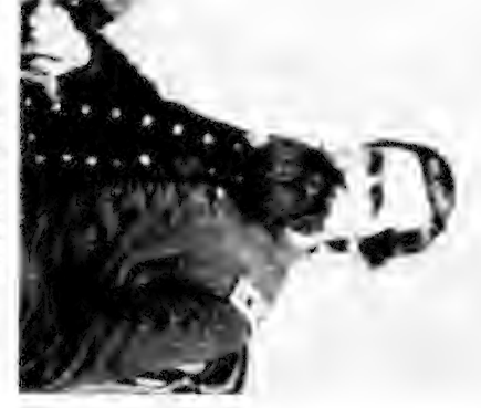
TOTAL THUS WAS AND A SHIPPEN